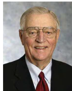
Walter F. Mondale Honorary Consul General

A handwritten signature in black ink, appearing to read 'Walter F. Mondale'.