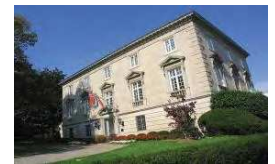
Royal Norwegian Embassy, Washington, DC

Through climate change and turbulent economic times, science and innovation are essential to survive on this planet. We need new energy concepts, clean technologies and medical technologies . We need new knowledge about biodiversity , and ecology , and we need international partnerships and good policies. Knowledge, technology and innovation are important tools in order to find solutions . With Charles Darwin's "On the Origin of Species" as a backdrop, Science Week 2009 will focus on transatlantic cooperation to develop sustainable solutions for our common future.