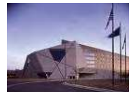
McNamara Alumni Center, University of Minnesota, Minneapolis, MN