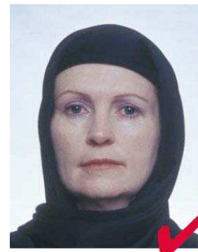
No. 6: religious head-dress correctly applied