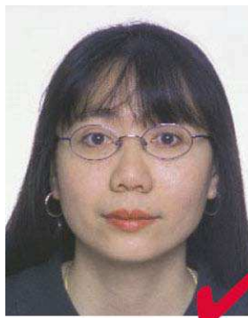
No. 5: glasses OK