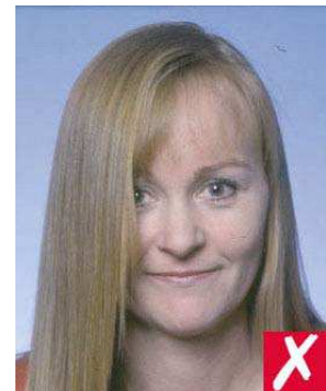
No. 3: hair covering eyes