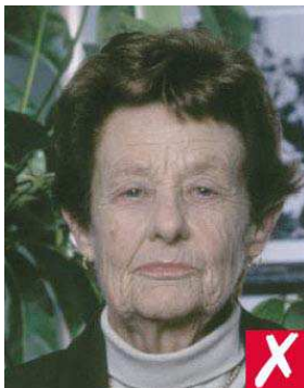
No. 1: background