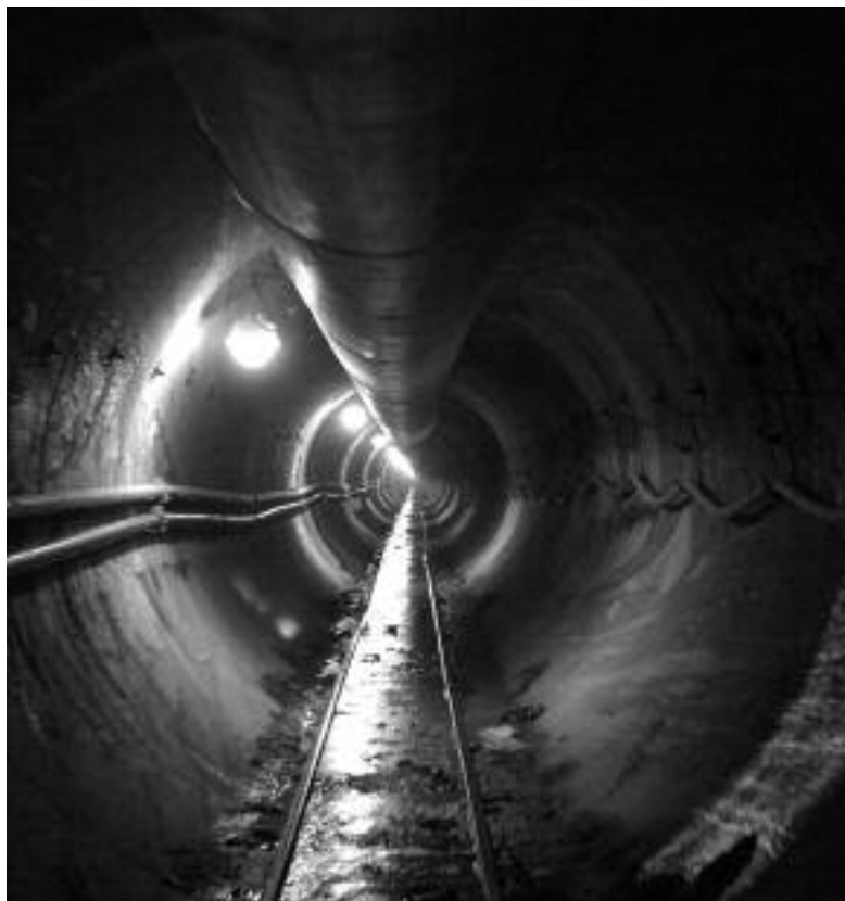
Photos: Facing page: Svein Arne Skjervheim, a Norwegian engineer currently working on a water tunnel on Manhattan, inspects the Norwegian-owned tunnel boring machine (TBM) with a colleague. The scars on the granite wall are covered with foam to prevent the tunnel from filling with dust when the TBM drills its way south on the New York island. This page, clockwise from top left: The instructions and signs on the TBM are written in both Norwegian and English; a view of the tunnel. Electricity is transported on the sidewalls, while fresh air is brought in along the ceiling; a young "sandhog" takes a break during the long, long nightshift.

"Who cares about the weather? Down here it rains all the time anyway!"