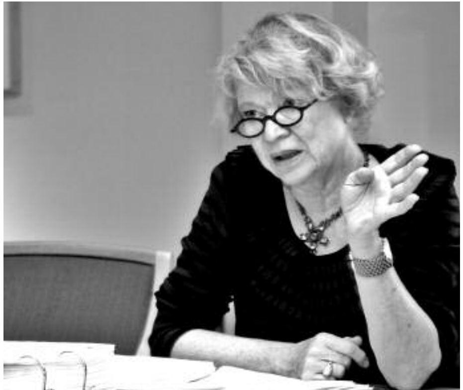
Eva Joly has been at the forefront of the global fight against corruption for many years, and her advice is sought by governments and businesspeople all over the world. Her efforts have been recognized by among others Transparency International, who described her as a person of "extraordinary valor" when awarding her the Integrity Award in 2001. Here she is seen giving a lecture to a group of Russian entrepreneurs in Washington, DC in March.