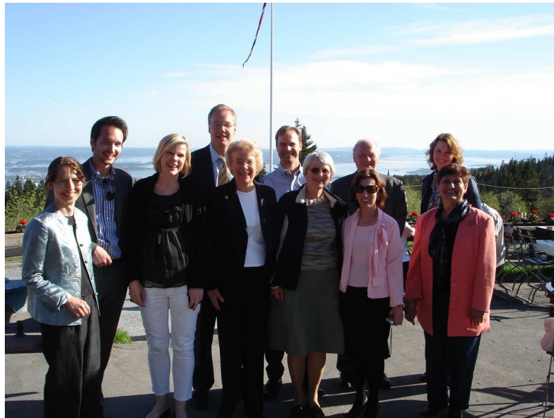
Board and staff, May 2008