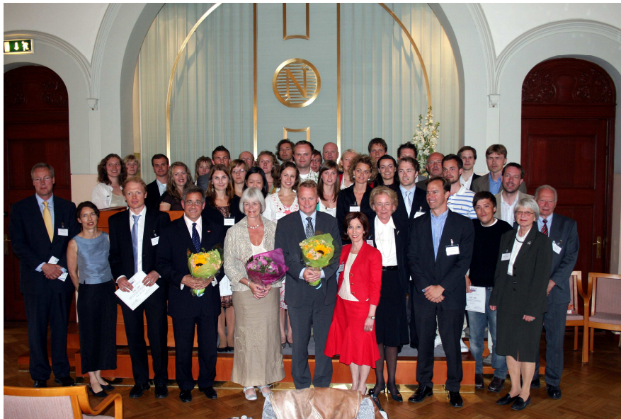
Reception for the 2008-09 Norwegian Fulbright grantees to the U.S.