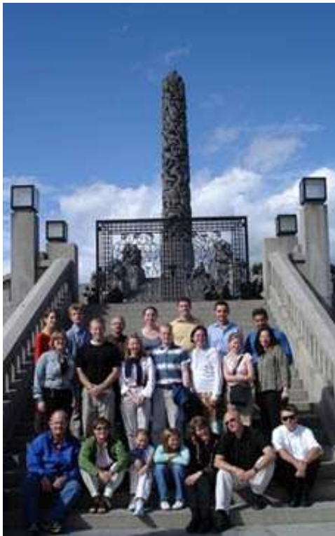
2005-06 U.S. Fulbrighters